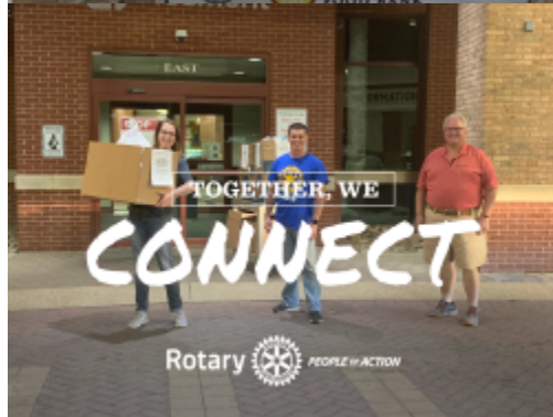
Posted by Mandy Timmons June 1, 2020