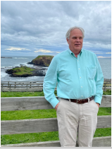
Thank You to Our 2022 Club and District Award Winners and to Their Rotarians

Rotary International is pleased to announce the winners of the 2022 Club and District Awards. These awards recognize the outstanding achievements of Rotarians and their clubs in the past year. The winners were selected based on their contributions to their communities and the world. We congratulate all winners and thank all Rotarians for their dedication and service.