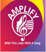
Area 11 Invited Rotarian at 2022 District Conference - Registration Open

The 2022 District Conference and Collaborative Community Grant Award Announcement is now open. This is a great opportunity for Rotarians to apply for grants to support their community projects. The grants are awarded to clubs that have demonstrated a commitment to service and a strong track record of success. We encourage all clubs to apply and to share their stories with us.