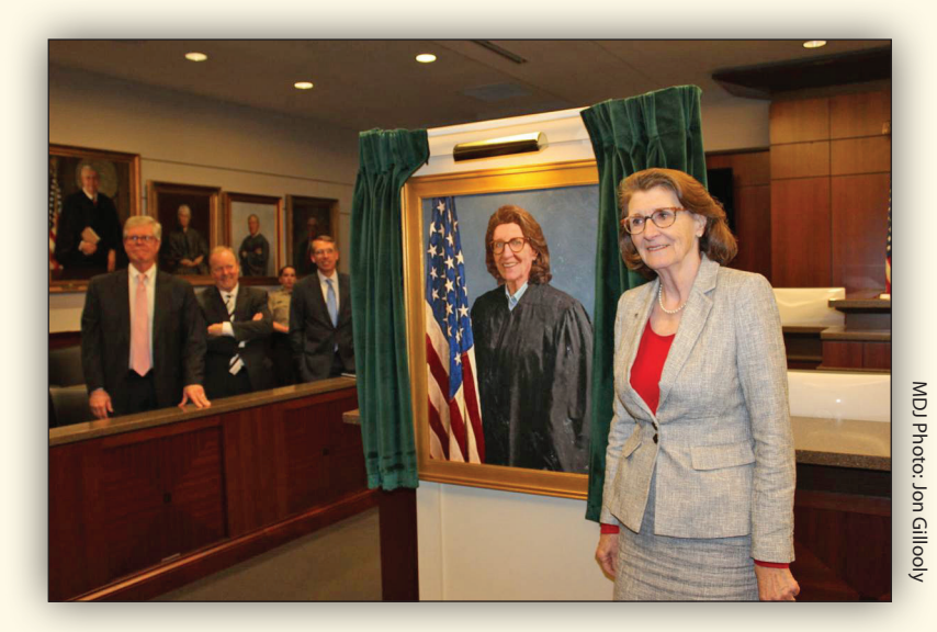
"A Picture of All That Rotary Is"

She came to America when she was only twenty-two years old. That was in April of 1967. She was born in the East End of London on December 4th, 1944. That's London, England not London, Kentucky. Somewhere along the way after becoming a U.S. Citizen in 1972, this dear lady yielded to good 'judgment' and attended a Rotary Club of Marietta meeting. She would then be inducted into the Rotary Club of Marietta on March 15th, 1991.