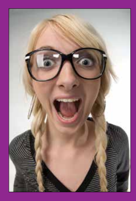
At this week's meeting we will have a professional photographer here to take headshots of all members. Please come early. The pictures will be used in the directory, Rotalight, and online.