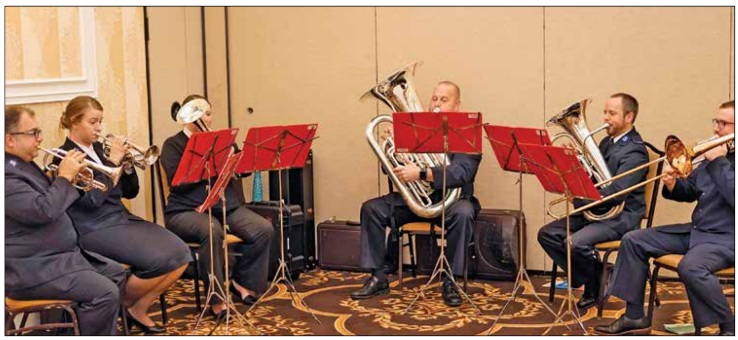
THE SALVATION ARMY BAND