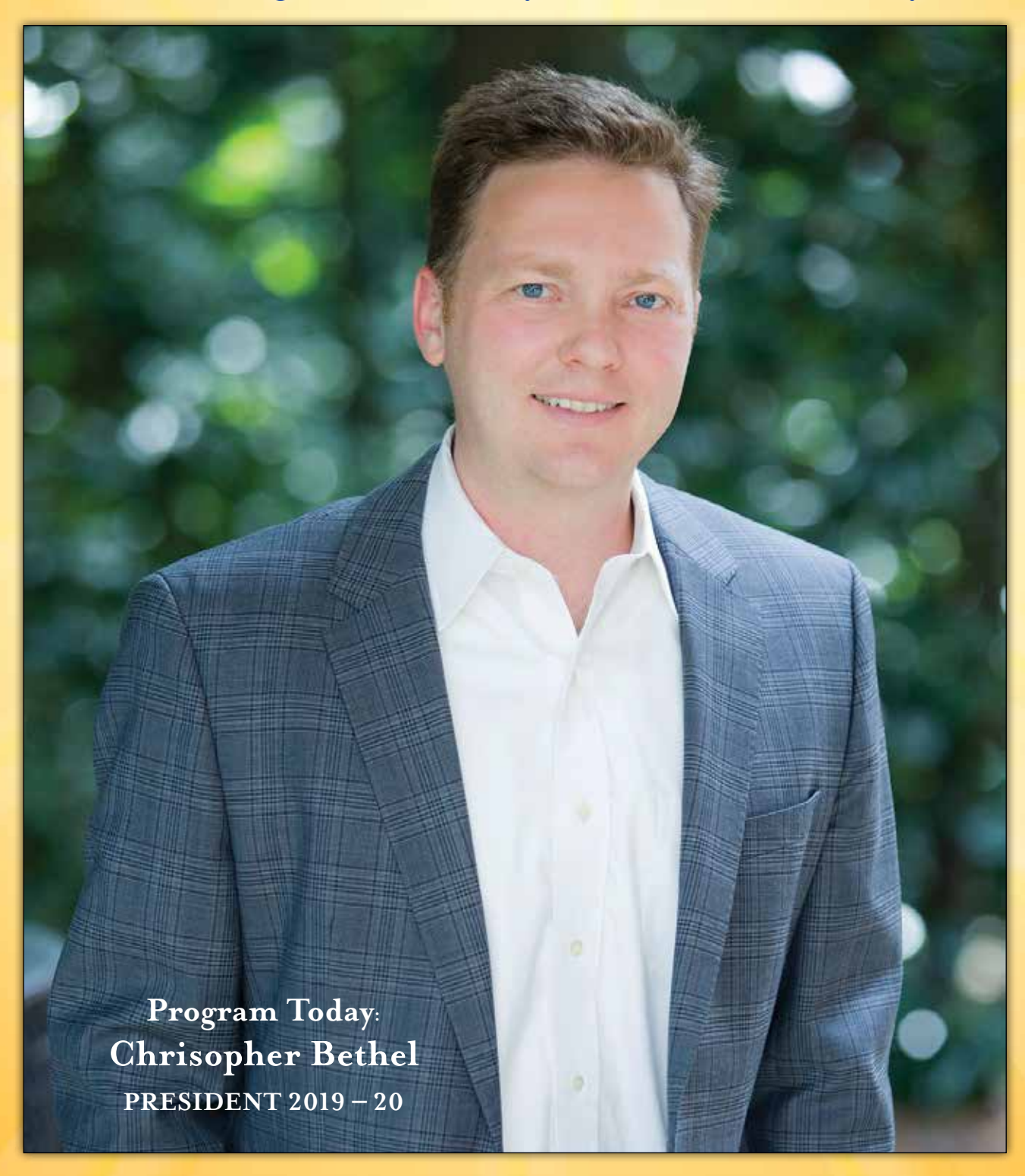
July 10, 2019 • Volume 83, Number 1

Celebrating 100 Years of "Service Above Self"