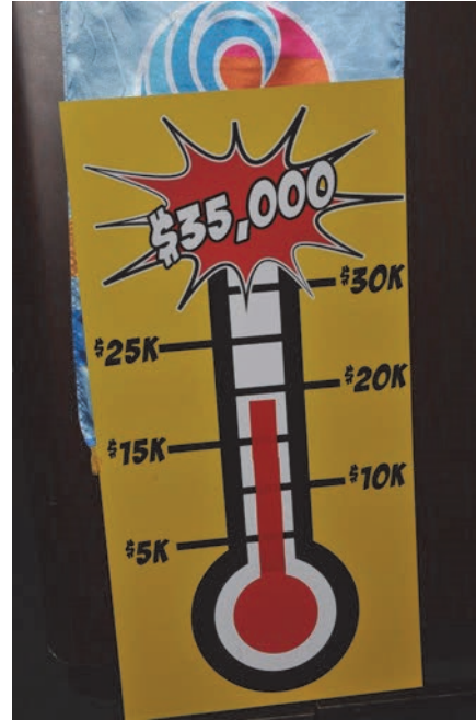
Golf Tournament Fundraising Progress