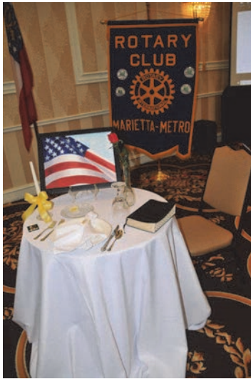
Fallen Comrade Table