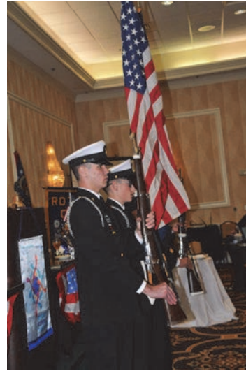
The Lassiter High School Navy JROTC Color Guard presented the colors.