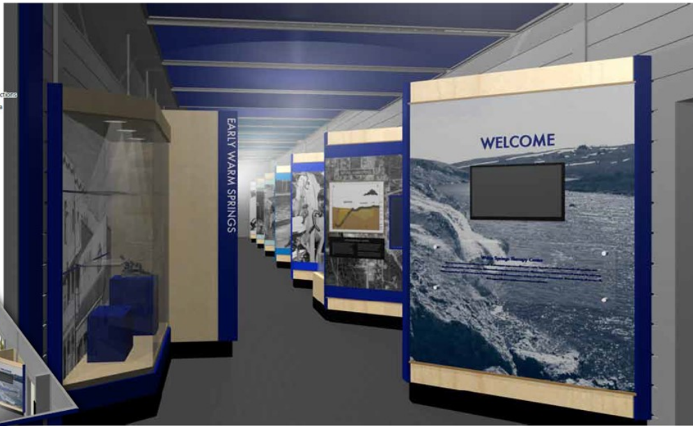
Entrance View Looking Down Main Aisle