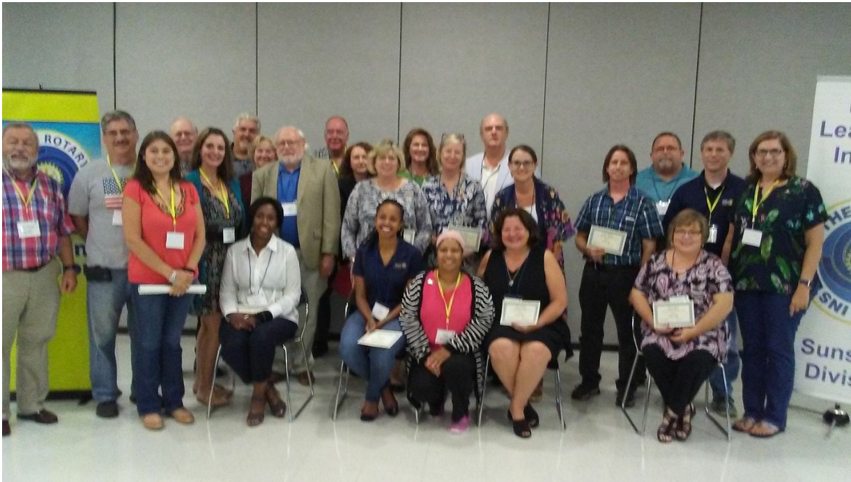
Our most recent District 6900 RLI participants ... students and trainers all learn through their RLI experience.