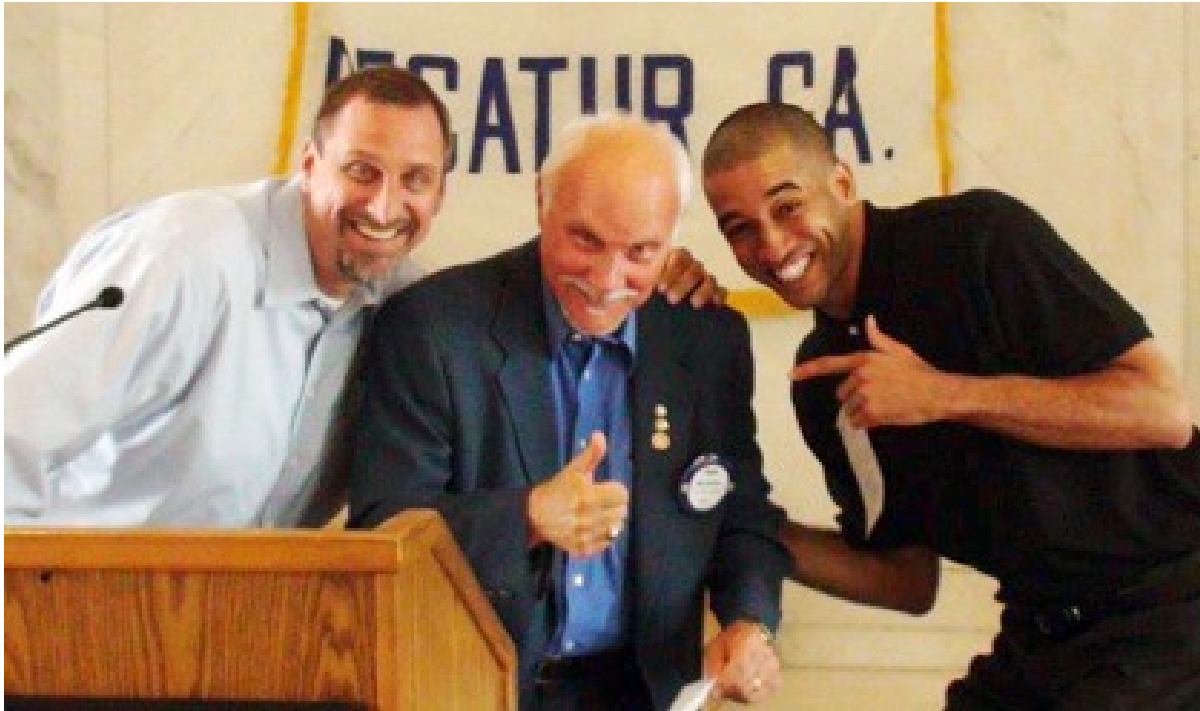
Boys and Girls Club grant recipients with Decatur Rotary's Community Grants Chair

More than 60 District 6900 Rotarians and family members attended this year's Rotary International Convention in Toronto, Canada. We were treated to amazing entertainment and speaker's - including Former First Lady Laura Bush and many more. [more]