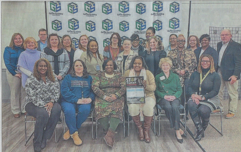
Griffin Daybreak Rotary members along with members of the Rotary Clubs of Atlanta Southern Crescent and Henry County met with Griffin-Spalding School System counselors, social workers and central office employees to raise awareness of the problem of human trafficking in the community. All GSCS middle and high schools were provided with human trafficking resources.

Rotary members discuss human trafficking with GSCS staff