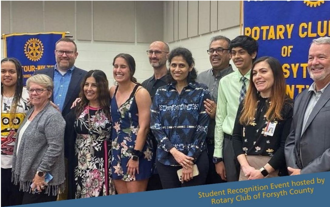
Student Recognition Event hosted by Rotary Club of Forsyth County