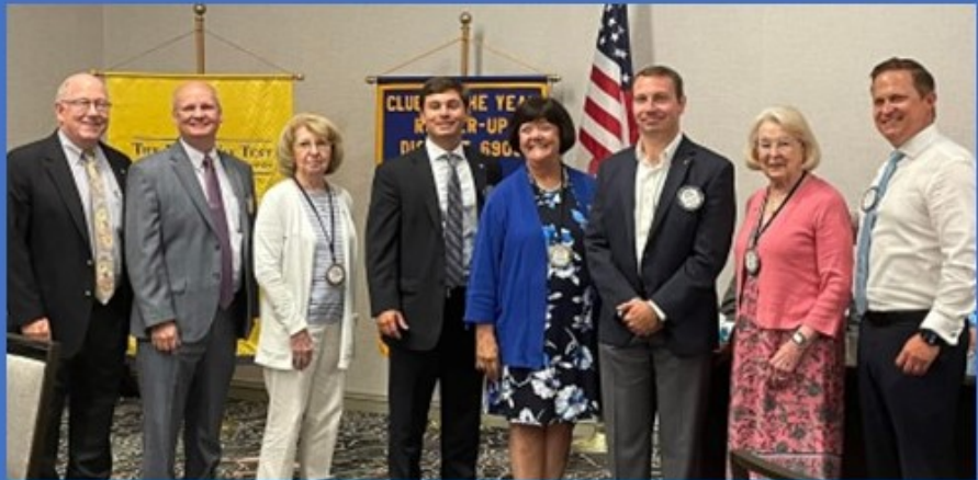
Marietta Metro's new leadership team