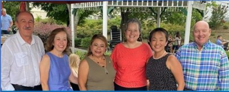
Atlanta Brasil – celebrating three-year anniversary