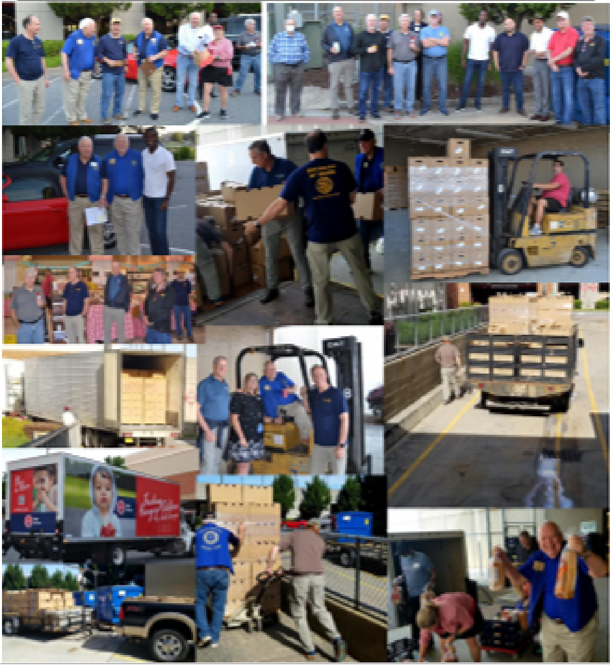
USDA FOOD BOXES PICK UP & DISTRIBUTION AT SOLIDARITY SANDY SPRINGS MAY 20, 2021