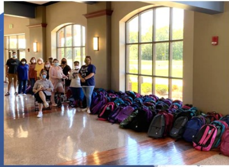
Barnesville helping fill school bags