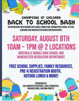
Meriwether County supports Back to School Bash