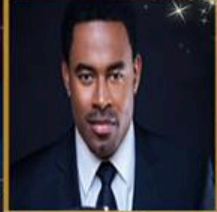
Actor Lamman Rucker