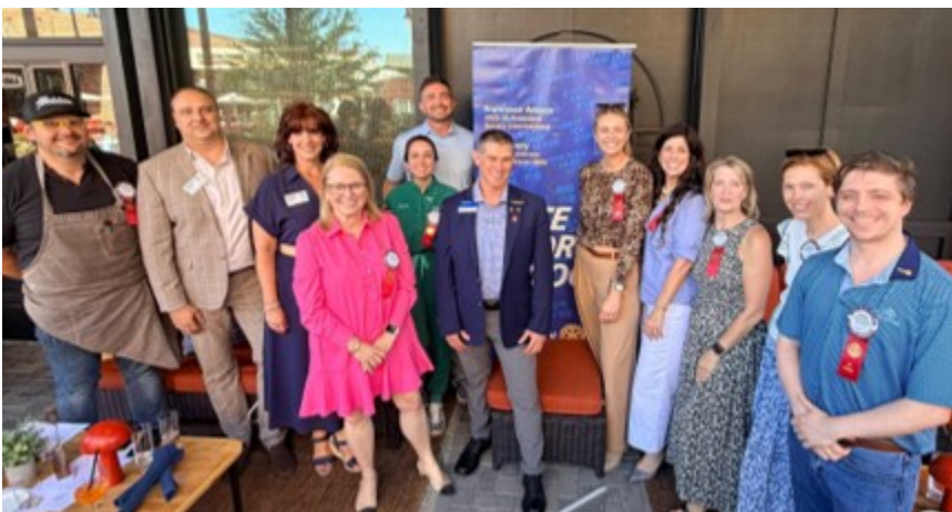
Trilith Companion Club