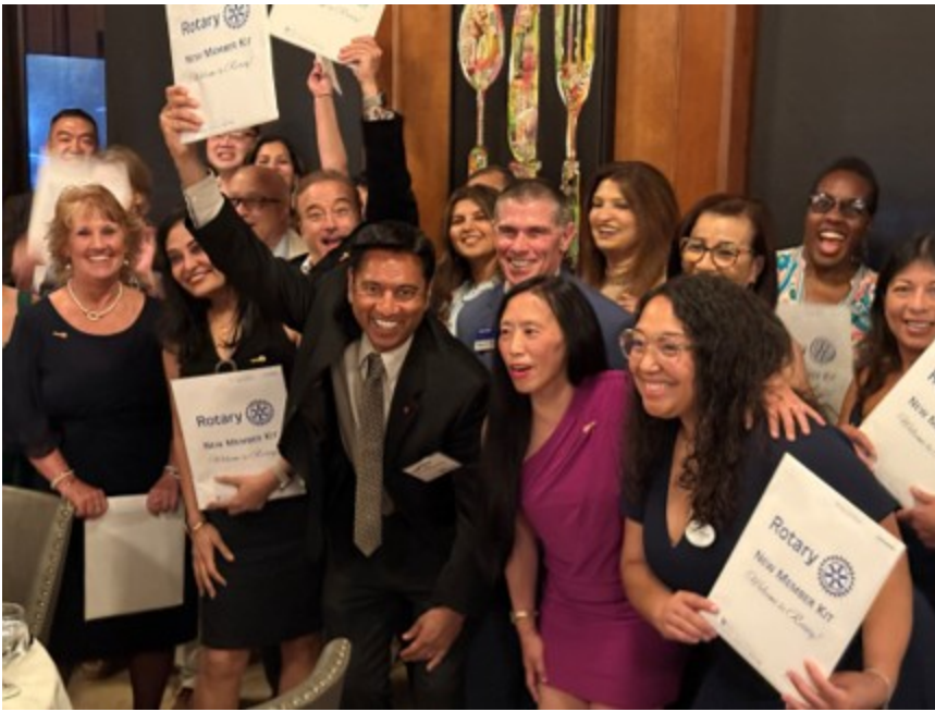
North Atlanta Professional Alliance

We are excited to welcome two new clubs to District 6900: