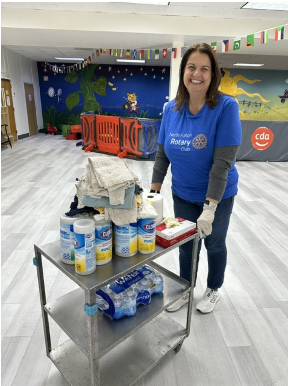
Posted by Lisa Gelber January 20, 2026