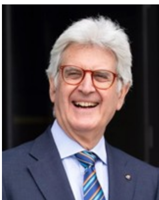
Posted by Jon Yaeger January 19, 2026