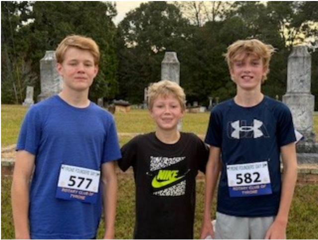
Posted by Dorothy Hart November 5, 2025