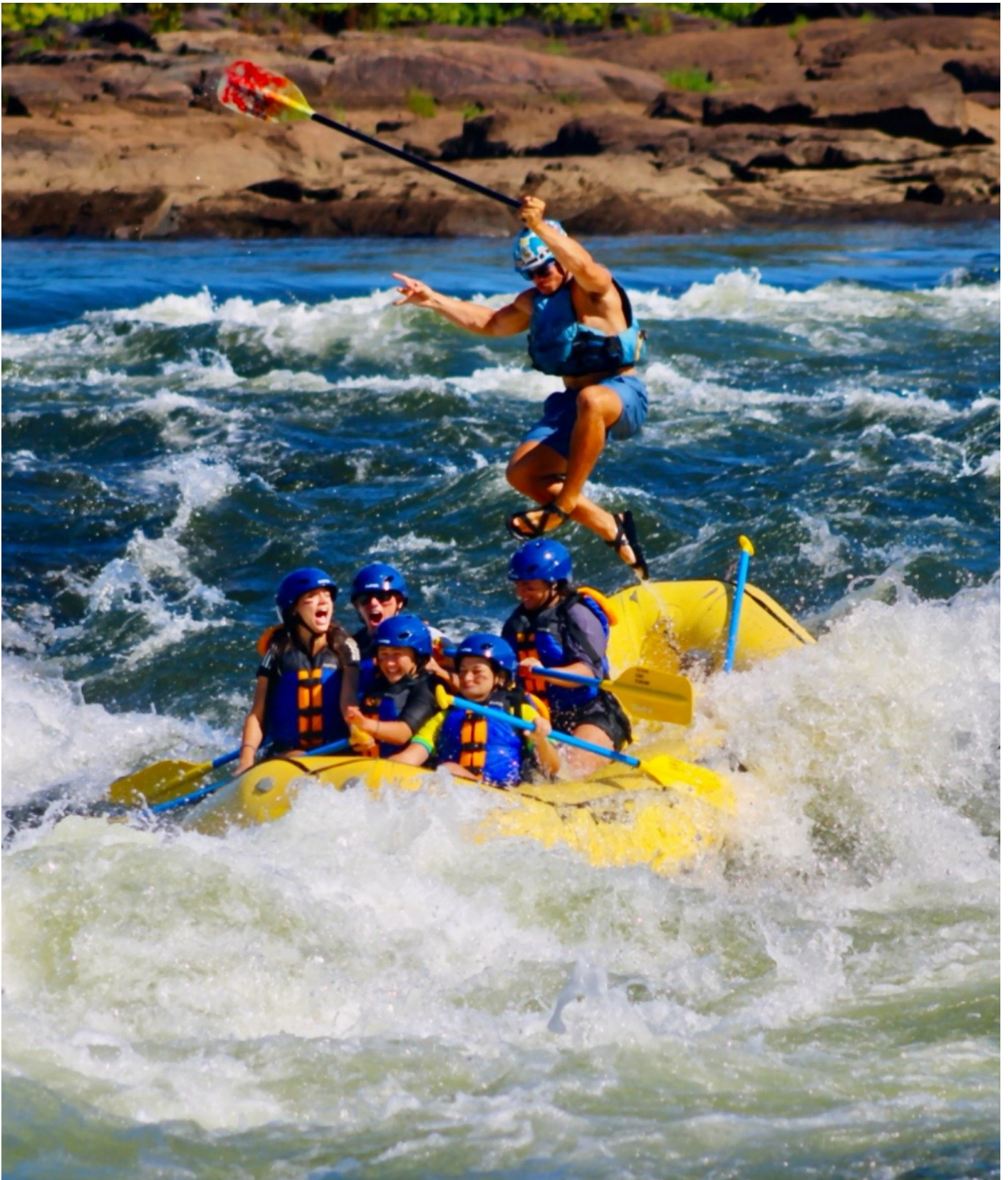
Posted by Kathyeryne Fields August 28, 2024