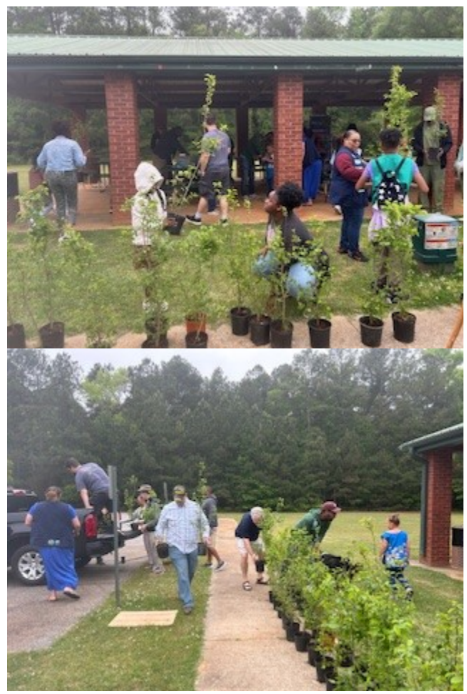
Posted by Amy Lemelin May 5, 2024