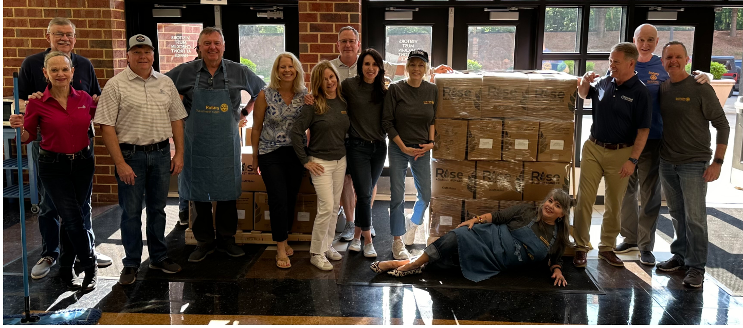
Posted by Lisa Gelber May 5, 2024