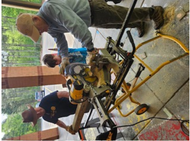
Posted by Sally Platt May 5, 2024