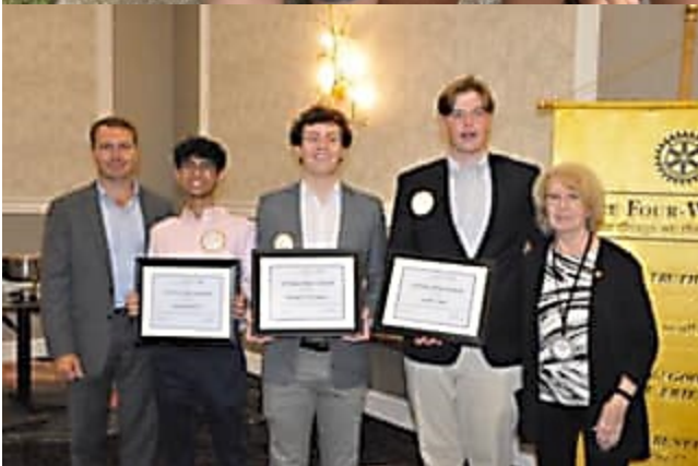
Posted by Sally Platt August 22, 2023