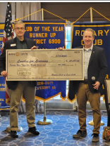
2022 COVID-19 The Rotary Foundation is grateful for the support and contributions of our members, supporters and community partners throughout the year. We thank you for your dedication and service to our community.