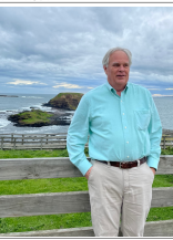
Thank You for a Great Year Was 2022 COVID-19 and the Thank You! The Rotary Foundation is grateful for the support and contributions of our members, supporters and community partners throughout the year. We thank you for your dedication and service to our community.