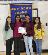
2022 COVID-19 The Rotary Foundation is grateful for the support and contributions of our members, supporters and community partners throughout the year. We thank you for your dedication and service to our community.