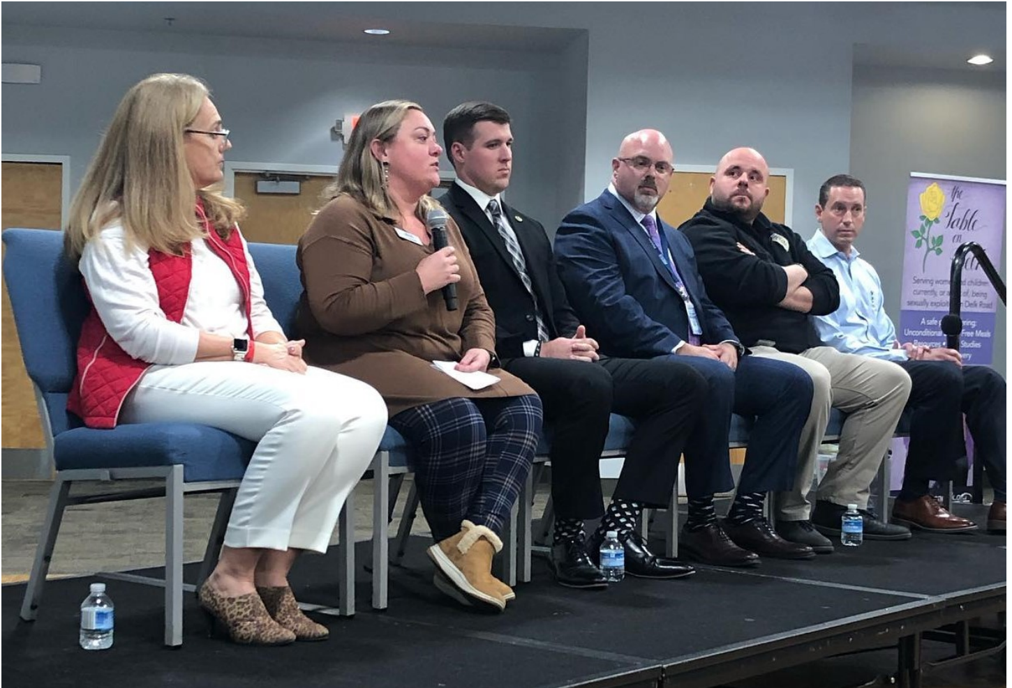
Posted by Hicks Malonson March 27, 2023