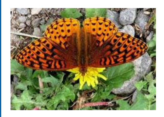
Great Spangled Fritillary butterfly (Speyeria cybele)