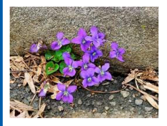
Common Blue Violet (Viola sororia)

Contact Cathie Brumfield for more information.