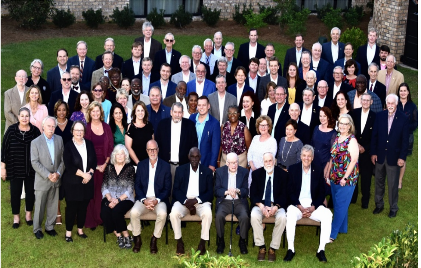
The Rotary Club of Thomasville was officially launched in the first week of May 1921. Exactly 100 years