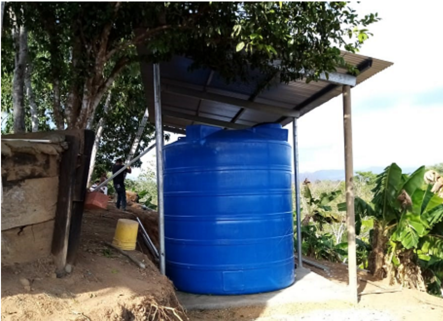
Posted by Trummie Patrick June 3, 2021