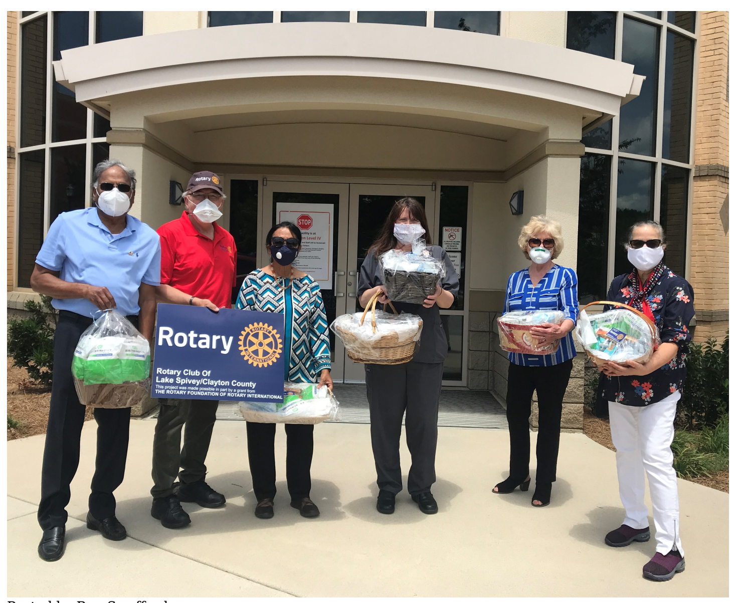
Posted by Ron Swofford May 28, 2020