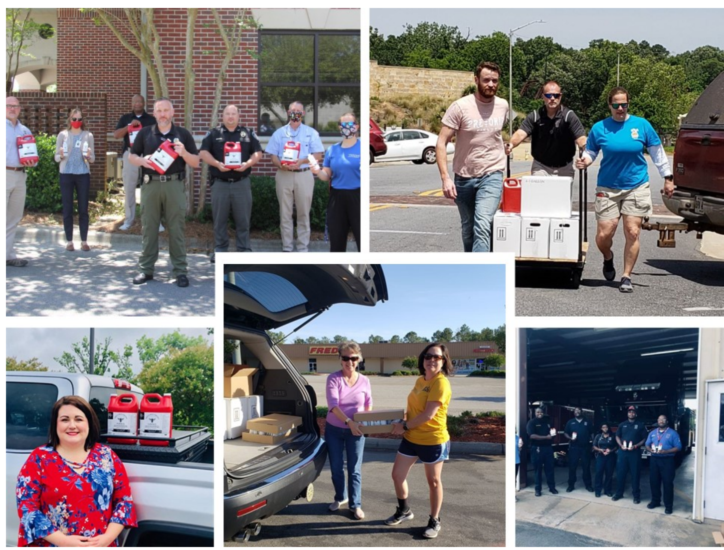
Posted by Anne Glenn June 1, 2020