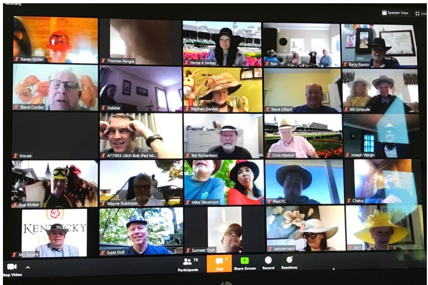
Posted by Clark Savage May 28, 2020