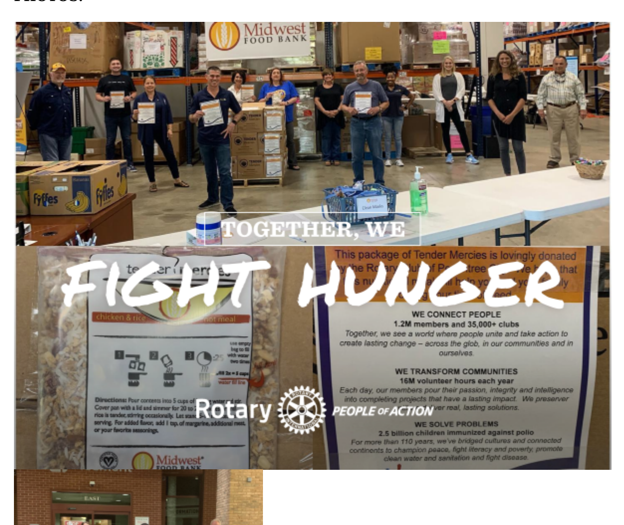
Posted by Mandy Timmons June 1, 2020