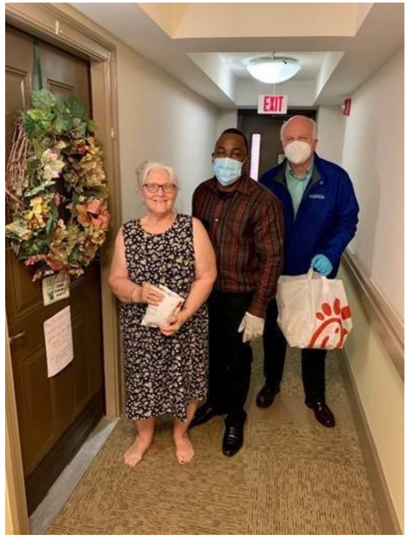
Posted by Christopher Bethel June 1, 2020