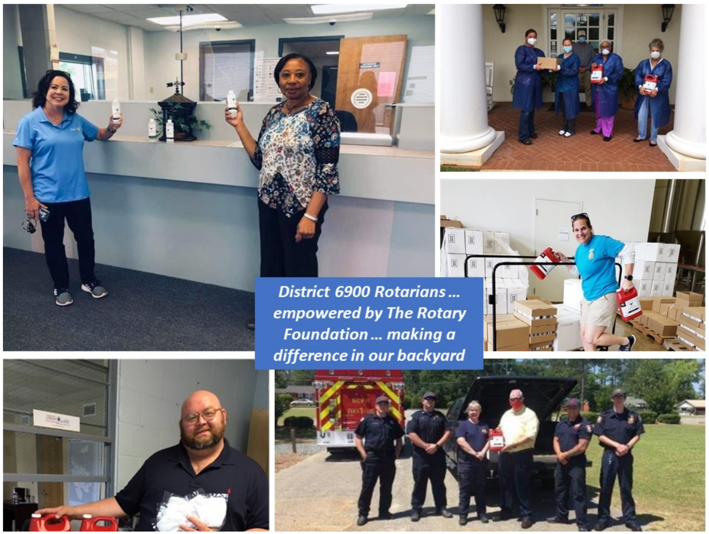
Posted by Anne Glenn June 1, 2020